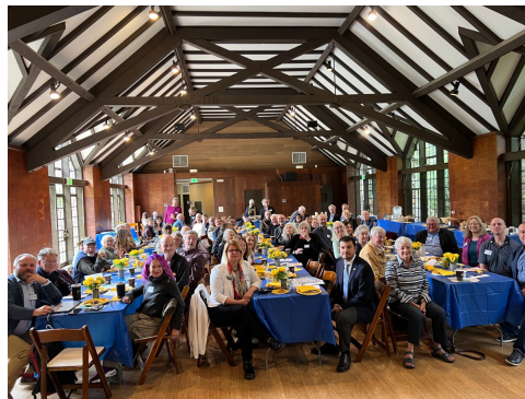
On September 25, more than 70 Rotarians and guests celebrated the Berkeley Rotary Peace Grove Ceremony in the Brazilian Room while others joined on Zoom.