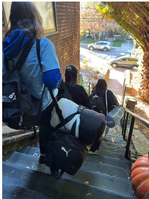
Photo: Interactors heading back to Cal at 8 AM with all their gear.